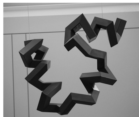
Figure 1. With the students' help, we transformed atomic coordinates (left, rendered with UCSF Chimera [28]) into remarkably accurate three-dimensional steel sculptures (right, approximately 1 m in height).