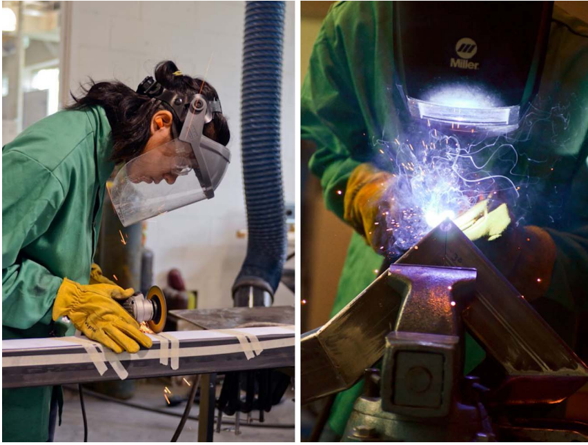
Figure 3. Undergraduates helped design and fabricate steel protein sculptures using published scientific data. doi:10.1371/journal.pbio.1001491.g003

three-dimensional design. Students puzzle over the underlying system for the complex joints; to these art students, the project is a contemporary sculpture, drawing on the history of minimalism and on abstract works like Constantine Brancusi's The Endless Column . Yet the sculptures also spark interest in the underlying science; in one instance a student asked, "How do scientists know the angles in a protein?"